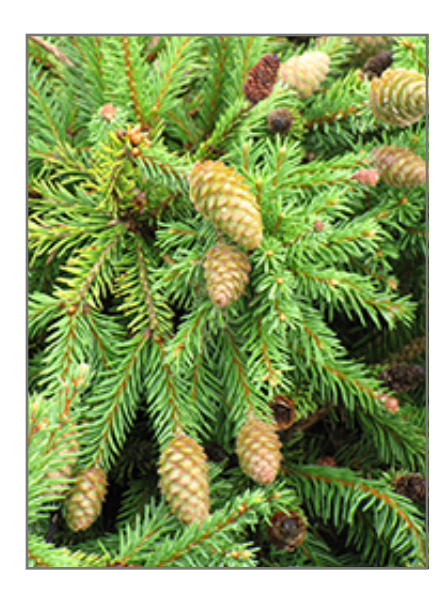
Pusch Spruce foliage