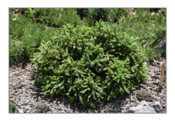
Pusch Spruce