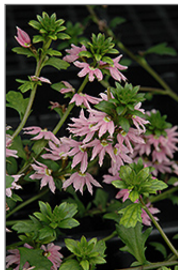
Bombay Pink Fan Flower flowers