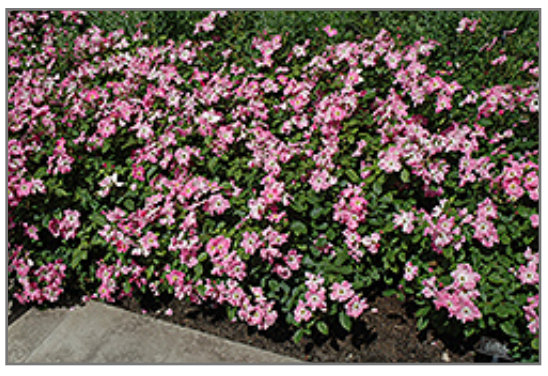
Nearly Wild Rose in bloom