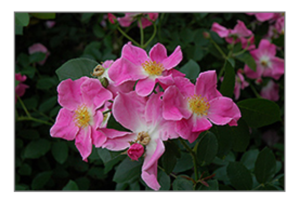
Nearly Wild Rose flowers

Nearly Wild Rose is recommended for the following landscape applications;