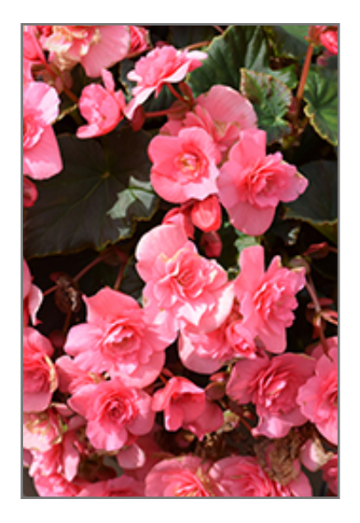
Solenia Light Pink Begonia flowers