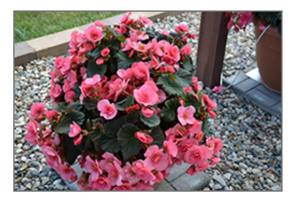
Solenia Light Pink Begonia in bloom

Solenia Light Pink Begonia is a fine choice for the garden, but it is also a good selection for planting in outdoor containers and hanging baskets. It is often used as a 'filler' in the 'spiller-thriller-filler' container combination, providing a mass of flowers against which the thriller plants stand out. Note that when growing plants in outdoor containers and baskets, they may require more frequent waterings than they would in the yard or garden.