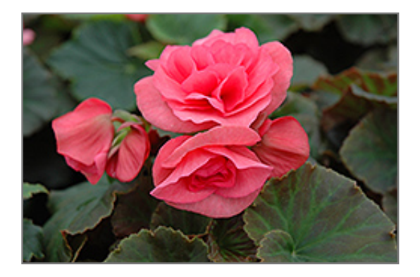
Solenia Light Pink Begonia flowers

This is a high maintenance plant that will require regular care and upkeep, and usually looks its best without pruning, although it will tolerate pruning. Deer don't particularly care for this plant and will usually leave it alone in favor of tastier treats. Gardeners should be aware of the following characteristic(s) that may warrant special consideration;