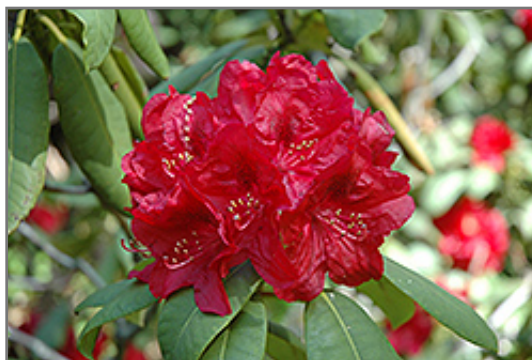
Henry's Red Rhododendron flowers

Henry's Red Rhododendron will grow to be about 5 feet tall at maturity, with a spread of 6 feet. It tends to be a little leggy, with a typical clearance of 1 foot from the ground, and is suitable for planting under power lines. It grows at a slow rate, and under ideal conditions can be expected to live for 40 years or more.