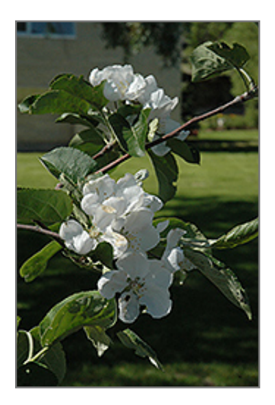
MacIntosh Apple flowers