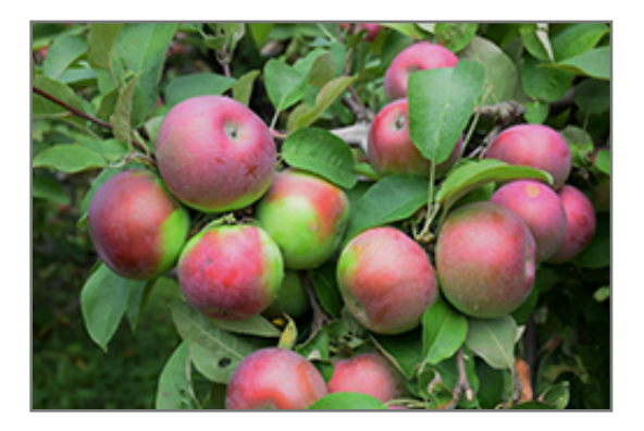
MacIntosh Apple fruit

MacIntosh Apple features showy clusters of lightly-scented white flowers with shell pink overtones along the branches in mid spring, which emerge from distinctive pink flower buds. It has forest green deciduous foliage. The pointy leaves turn yellow in fall. The fruits are showy red apples with hints of light green, which are carried in abundance in early fall. The fruit can be messy if allowed to drop on the lawn or walkways, and may require occasional clean-up.