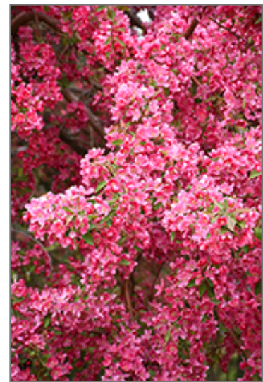
Prairifire Flowering Crab flowers