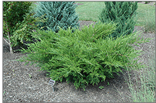
Sea Green Juniper