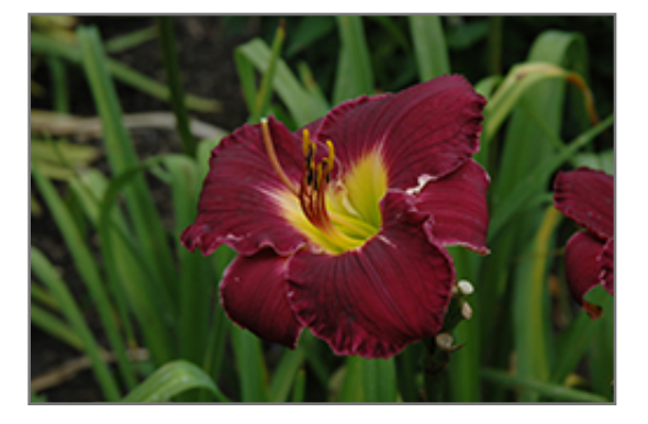
Bela Lugosi Daylily flowers