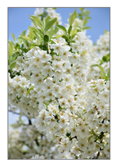
Lollipop Flowering Crab flowers