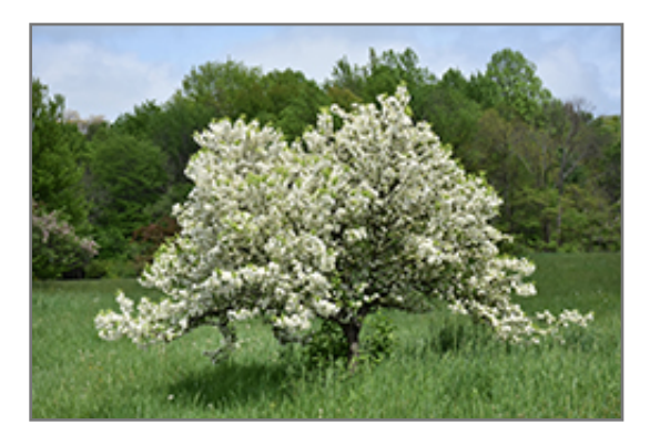
Lollipop Flowering Crab in bloom

This is a high maintenance shrub that will require regular care and upkeep, and is best pruned in late winter once the threat of extreme cold has passed. Gardeners should be aware of the following characteristic(s) that may warrant special consideration;