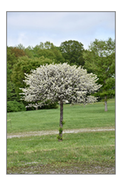
Lollipop Flowering Crab in bloom

This shrub should only be grown in full sunlight. It prefers to grow in average to moist conditions, and shouldn't be allowed to dry out. It is not particular as to soil type or pH. It is highly tolerant of urban pollution and will even thrive in inner city environments. This particular variety is an interspecific hybrid.