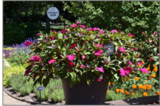
Solarscape Magenta Bliss Impatiens in bloom

Solarscape Magenta Bliss Impatiens will grow to be about 9 inches tall at maturity, with a spread of 20 inches. When grown in masses or used as a bedding plant, individual plants should be spaced approximately 14 inches apart. Its foliage tends to remain low and dense right to the ground. This fast-growing annual will normally live for one full growing season, needing replacement the following year.