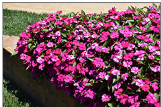
Solarscape Magenta Bliss Impatiens in bloom