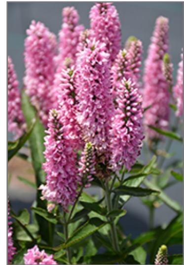
Skyward Pink Long-leaf Speedwell flowers

Skyward Pink Long-leaf Speedwell is a fine choice for the garden, but it is also a good selection for planting in outdoor pots and containers. It is often used as a 'filler' in the 'spiller-thriller-filler' container combination, providing a mass of flowers against which the larger thriller plants stand out. Note that when growing plants in outdoor containers and baskets, they may require more frequent waterings than they would in the yard or garden. Be aware that in our climate, most plants cannot be expected to survive the winter if left in containers outdoors, and this plant is no exception. Contact our experts for more information on how to protect it over the winter months.