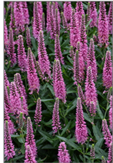
Skyward Pink Long-leaf Speedwell flowers

Skyward Pink Long-leaf Speedwell is recommended for the following landscape applications;