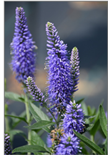
Skyward Blue Long-leaf Speedwell flowers

Skyward Blue Long-leaf Speedwell is a fine choice for the garden, but it is also a good selection for planting in outdoor pots and containers. It is often used as a 'filler' in the 'spiller-thriller-filler' container combination, providing a mass of flowers against which the larger thriller plants stand out. Note that when growing plants in outdoor containers and baskets, they may require more frequent waterings than they would in the yard or garden. Be aware that in our climate, most plants cannot be expected to survive the winter if left in containers outdoors, and this plant is no exception. Contact our experts for more information on how to protect it over the winter months.