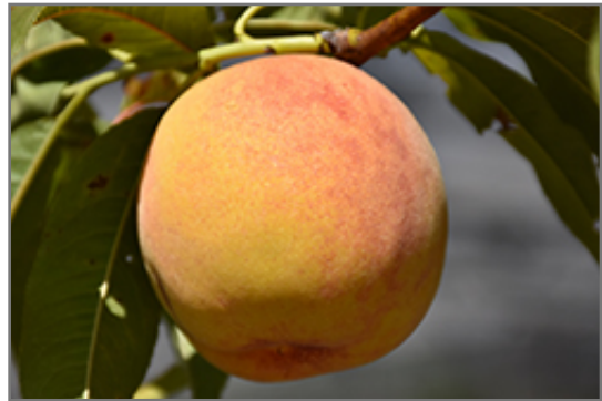
Reliance Peach fruit