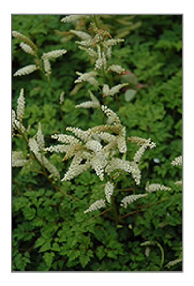
Dwarf Goatsbeard flowers