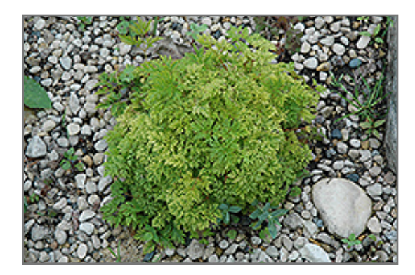
Dwarf Goatsbeard