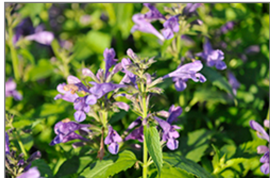
Prelude Purple Catmint flowers