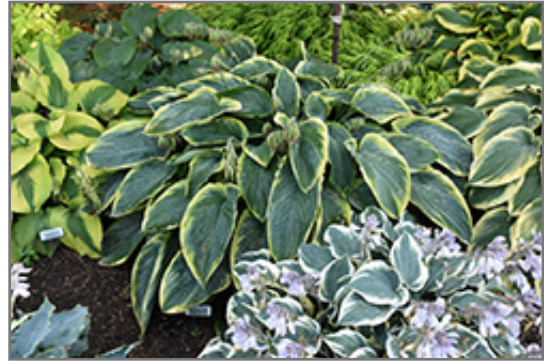
Shadowland Wu-La-La Hosta

This is a relatively low maintenance plant, and is best cleaned up in early spring before it resumes active growth for the season. Gardeners should be aware of the following characteristic(s) that may warrant special consideration;