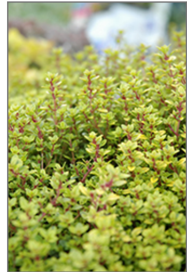
Archer's Gold Thyme flowers