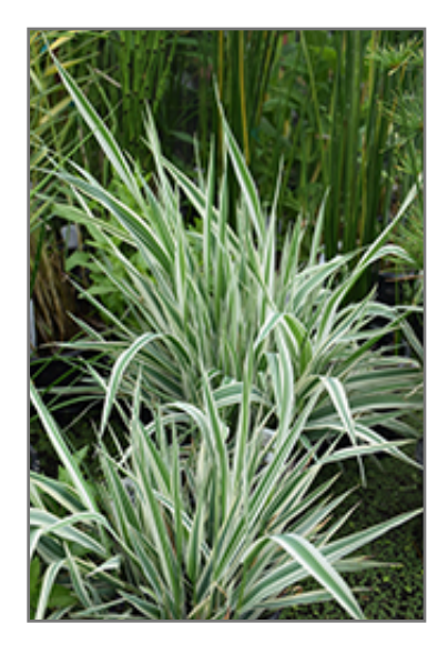
Tricolor Ribbon Grass