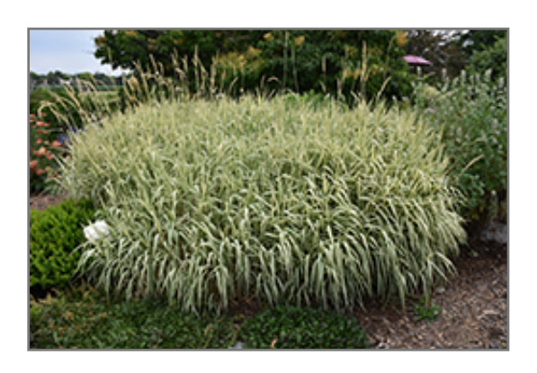
Tricolor Ribbon Grass

Tricolor Ribbon Grass will grow to be about 24 inches tall at maturity, with a spread of 3 feet. It grows at a fast rate, and under ideal conditions can be expected to live for approximately 20 years. As an herbaceous perennial, this plant will usually die back to the crown each winter, and will regrow from the base each spring. Be careful not to disturb the crown in late winter when it may not be readily seen!