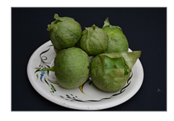
Tomatillo fruit

Tomatillo will grow to be about 5 feet tall at maturity, with a spread of 3 feet. When planted in rows, individual plants should be spaced approximately 3 feet apart. Because of its vigorous growth habit, it may require staking or supplemental support. This fast-growing vegetable plant is an annual, which means that it will grow for one season in your garden and then die after producing a crop.