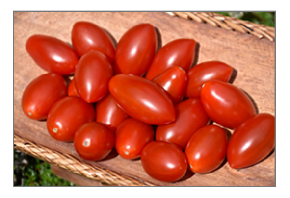
Sugary Tomato fruit

Sugary Tomato will grow to be about 4 feet tall at maturity, with a spread of 24 inches. When planted in rows, individual plants should be spaced approximately 24 inches apart. Because of its vigorous growth habit, it may require staking or supplemental support. This fast-growing vegetable plant is an annual, which means that it will grow for one season in your garden and then die after producing a crop.