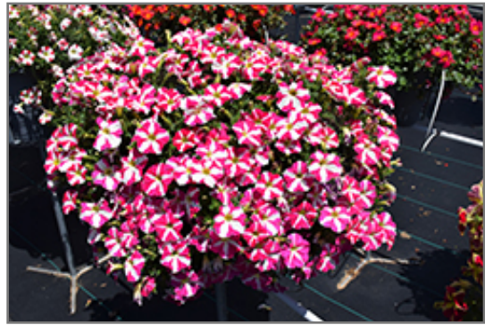
Amore Pink Heart Petunia in bloom

Amore Pink Heart Petunia will grow to be about 12 inches tall at maturity, with a spread of 14 inches. When grown in masses or used as a bedding plant, individual plants should be spaced approximately 10 inches apart. Its foliage tends to remain dense right to the ground, not requiring facer plants in front. This fast-growing annual will normally live for one full growing season, needing replacement the following year.