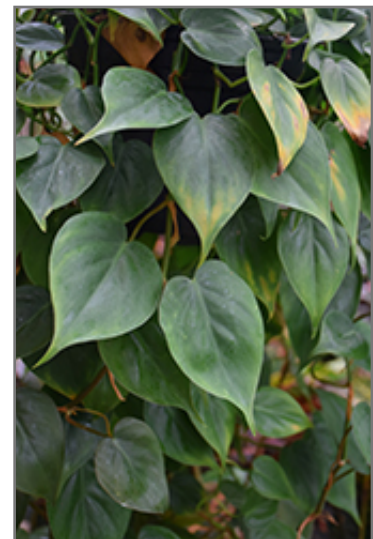
Jade Pothos foliage