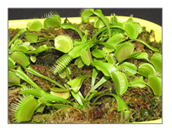
Venus Flytrap

When grown indoors, Venus Flytrap can be expected to grow to be only 5 inches tall at maturity extending to 12 inches tall with the flowers, with a spread of 8 inches. It grows at a slow rate, and under ideal conditions can be expected to live for approximately 5 years. This houseplant will do well in a location that gets either direct or indirect sunlight, although it will usually require a more brightly-lit environment than what artificial indoor lighting alone can provide. It prefers to grow in moist to almost wet soil, and will even tolerate some standing water. As such, the surface of the soil should be kept consistently moist to the touch, and you can expect to water this plant two or more times each week, especially if it's growing in a lower-humidity environment. Be aware that your particular watering schedule may vary depending on its location in the room, the pot size, plant size and other conditions; if in doubt, ask one of our experts in the store for advice. It is very fussy about its soil conditions and must be grown in rich, acidic soil to ensure success. Contact the store for specific recommendations on pre-mixed potting soil for this plant.