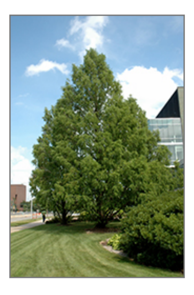
Dawn Redwood