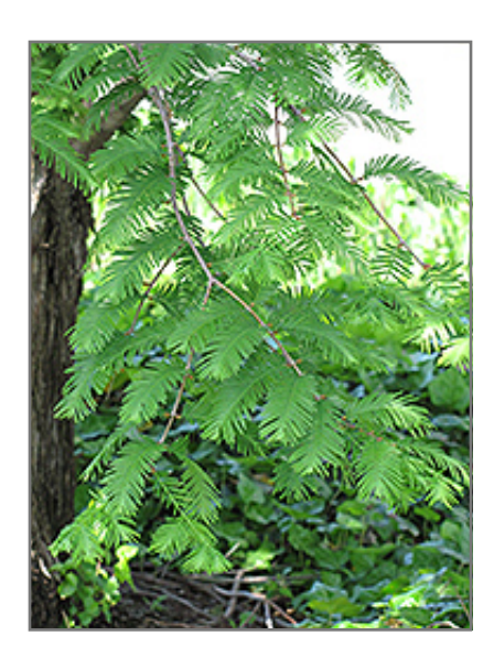
Dawn Redwood foliage