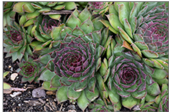
Black Hens And Chicks