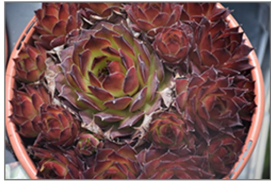
Black Hens And Chicks

Black Hens And Chicks is a fine choice for the garden, but it is also a good selection for planting in outdoor pots and containers. It is often used as a 'filler' in the 'spiller-thriller-filler' container combination, providing a canvas of foliage against which the larger thriller plants stand out. Note that when growing plants in outdoor containers and baskets, they may require more frequent waterings than they would in the yard or garden. Be aware that in our climate, most plants cannot be expected to survive the winter if left in containers outdoors, and this plant is no exception. Contact our experts for more information on how to protect it over the winter months.