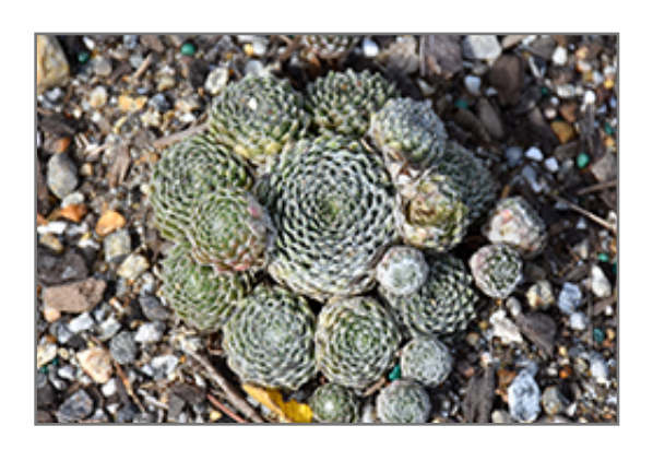
Chick Charms Cotton Candy Hens And Chicks

Chick Charms Cotton Candy Hens And Chicks is recommended for the following landscape applications;