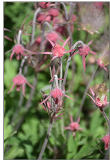
Prairie Smoke flower buds