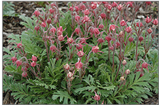
Prairie Smoke in bloom

This plant will require occasional maintenance and upkeep, and should be cut back in late fall in preparation for winter. It is a good choice for attracting butterflies to your yard, but is not particularly attractive to deer who tend to leave it alone in favor of tastier treats. Gardeners should be aware of the following characteristic(s) that may warrant special consideration;