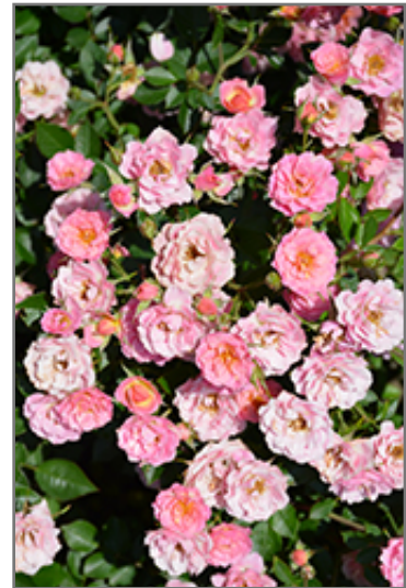
Oso Easy Petit Pink flowers