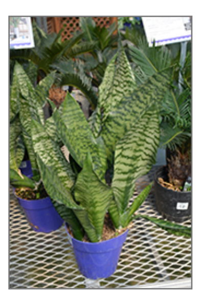
Futura Robusta Snake Plant

When grown indoors, Futura Robusta Snake Plant can be expected to grow to be about 24 inches tall at maturity, with a spread of 12 inches. It grows at a slow rate, and under ideal conditions can be expected to live for approximately 10 years. This houseplant performs well in both bright or indirect sunlight and strong artificial light, and can therefore be situated in almost any well-lit room or location. It is very adaptable to both dry and moist soil, and should do just fine under average home conditions. The surface of the soil shouldn't be allowed to dry out completely, and so you should expect to water this plant once and possibly even twice each week. Be aware that your particular watering schedule may vary depending on its location in the room, the pot size, plant size and other conditions; if in doubt, ask one of our experts in the store for advice. It is not particular as to soil pH, but grows best in sandy soil. Contact the store for specific recommendations on pre-mixed potting soil for this plant.