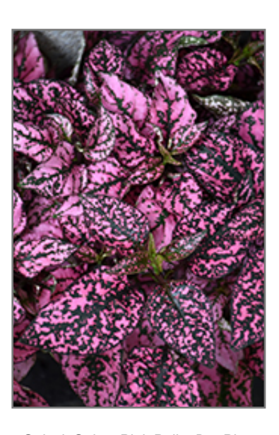
Splash Select Pink Polka Dot Plant foliage

When grown indoors, Splash Select Pink Polka Dot Plant can be expected to grow to be about 12 inches tall at maturity, with a spread of 12 inches. It grows at a fast rate, and under ideal conditions can be expected to live for approximately 5 years. This houseplant will do well in a location that gets either direct or indirect sunlight, although it will usually require a more brightly-lit environment than what artificial indoor lighting alone can provide. It does best in average to evenly moist soil, but will not tolerate standing water. The surface of the soil shouldn't be allowed to dry out completely, and so you should expect to water this plant once and possibly even twice each week. Be aware that your particular watering schedule may vary depending on its location in the room, the pot size, plant size and other conditions; if in doubt, ask one of our experts in the store for advice. It is not particular as to soil type or pH; an average potting soil should work just fine.