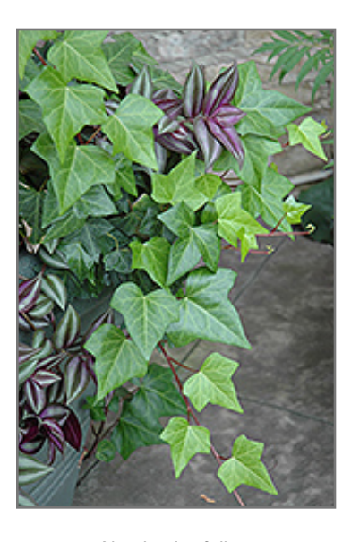
Algerian Ivy foliage

When grown indoors, Algerian Ivy can be expected to grow to be about 10 feet tall at maturity, with a spread of 3 feet. It grows at a fast rate, and under ideal conditions can be expected to live for approximately 30 years. This houseplant performs well in both bright or indirect sunlight and strong artificial light, and can therefore be situated in almost any well-lit room or location. It is very adaptable to both dry and moist soil, and should do just fine under average home conditions. The surface of the soil shouldn't be allowed to dry out completely, and so you should expect to water this plant once and possibly even twice each week. Be aware that your particular watering schedule may vary depending on its location in the room, the pot size, plant size and other conditions; if in doubt, ask one of our experts in the store for advice. It is not particular as to soil pH, but grows best in rich soil. Contact the store for specific recommendations on pre-mixed potting soil for this plant. Be warned that parts of this plant are known to be toxic to humans and animals, so special care should be exercised if growing it around children and pets.