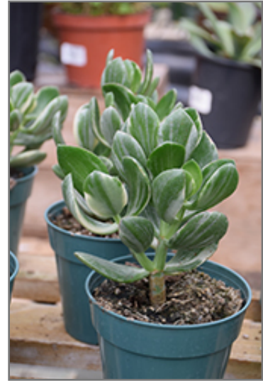
Variegated Jade Plant in full

This is a multi-stemmed evergreen houseplant with an upright spreading habit of growth. This plant can be pruned at any time to keep it looking its best.