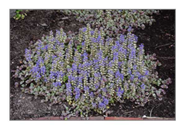
Burgundy Glow Bugleweed in bloom

Burgundy Glow Bugleweed is a fine choice for the garden, but it is also a good selection for planting in outdoor containers and hanging baskets. Because of its spreading habit of growth, it is ideally suited for use as a 'spiller' in the 'spiller-thriller-filler' container combination; plant it near the edges where it can spill gracefully over the pot. Note that when growing plants in outdoor containers and baskets, they may require more frequent waterings than they would in the yard or garden. Be aware that in our climate, most plants cannot be expected to survive the winter if left in containers outdoors, and this plant is no exception. Contact our experts for more information on how to protect it over the winter months.