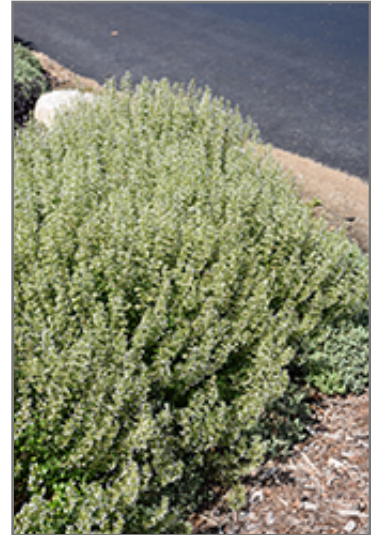
White Cloud Dwarf Calamint in bloom