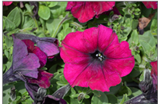
Easy Wave Burgundy Velour Petunia flowers