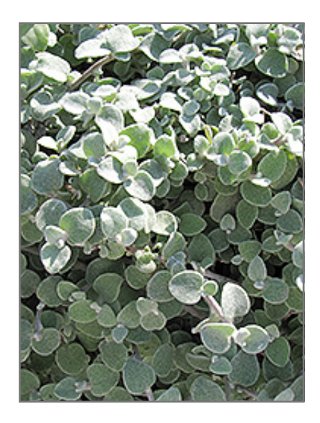
Licorice Plant foliage

81 Puddledock Rd Manchester, ME 04351 (207) 622-5965