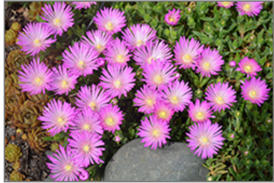
Table Mountain Ice Plant flowers

Table Mountain Ice Plant is recommended for the following landscape applications;