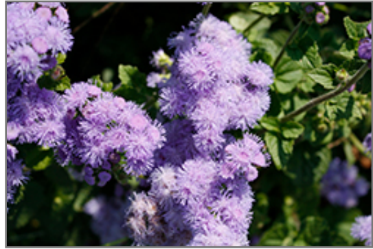
Blue Horizon Flossflower flowers

Blue Horizon Flossflower is recommended for the following landscape applications;