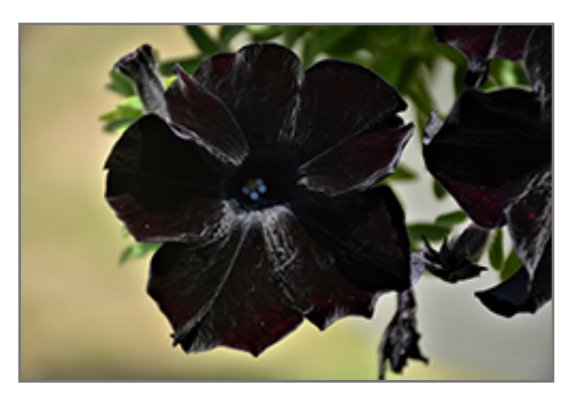
Crazytunia Black Mamba Petunia flowers

Crazytunia Black Mamba Petunia is recommended for the following landscape applications;