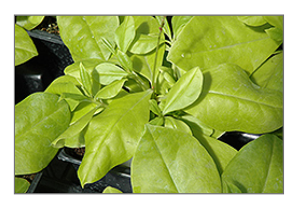
Limon Jewels Of Opar foliage

81 Puddledock Rd Manchester, ME 04351 (207) 622-5965