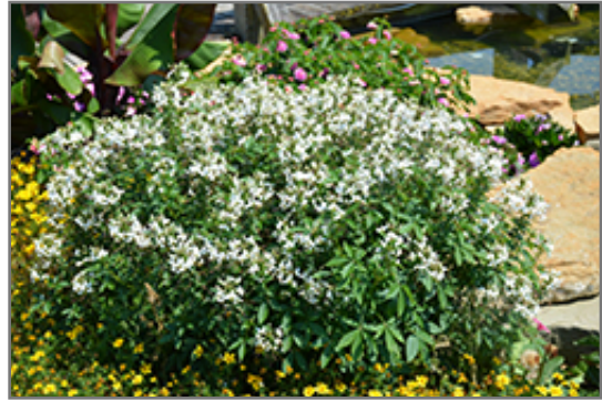
Senorita Blanca Spiderflower in bloom

Senorita Blanca Spiderflower is a fine choice for the garden, but it is also a good selection for planting in outdoor containers and hanging baskets. With its upright habit of growth, it is best suited for use as a 'thriller' in the 'spiller-thriller-filler' container combination; plant it near the center of the pot, surrounded by smaller plants and those that spill over the edges. It is even sizeable enough that it can be grown alone in a suitable container. Note that when growing plants in outdoor containers and baskets, they may require more frequent waterings than they would in the yard or garden.