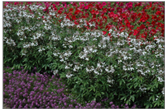
Senorita Blanca Spiderflower in bloom