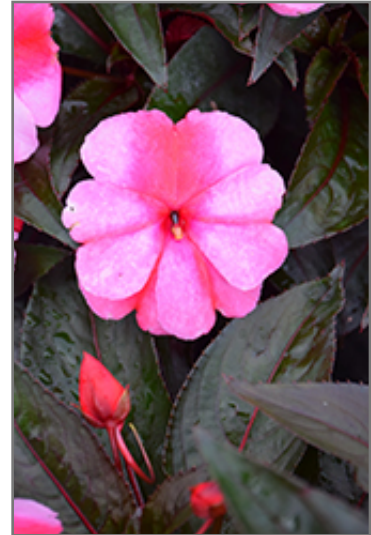
Super Sonic Sweet Cherry New Guinea Impatiens flowers

Super Sonic Sweet Cherry New Guinea Impatiens is recommended for the following landscape applications;