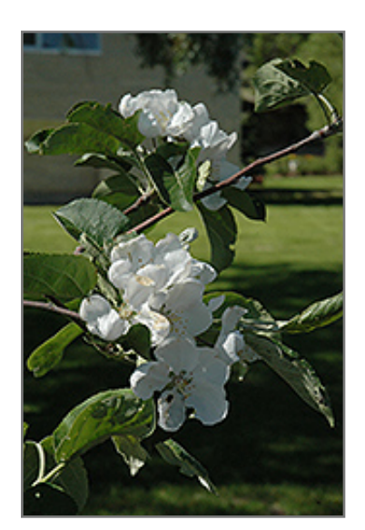
MacIntosh Apple flowers

MacIntosh Apple features showy clusters of lightly-scented white flowers with shell pink overtones along the branches in mid spring, which emerge from distinctive pink flower buds. It has forest green deciduous foliage. The pointy leaves turn yellow in fall. The fruits are showy red apples with hints of light green, which are carried in abundance in early fall. The fruit can be messy if allowed to drop on the lawn or walkways, and may require occasional clean-up.