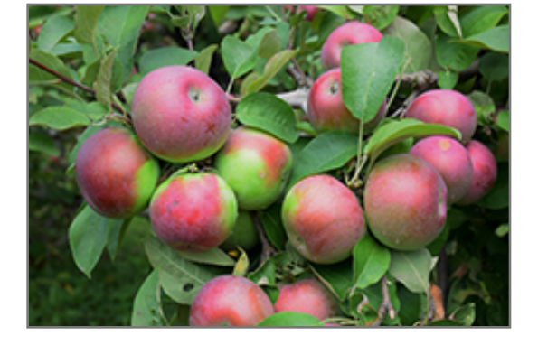
MacIntosh Apple fruit

One of the most famous hardy red apples, excellent for cooking; eating apples are high maintenance and need a second pollinator; the perfect combination of accent and fruit tree, very hardy, needs well-drained soil and full sun.